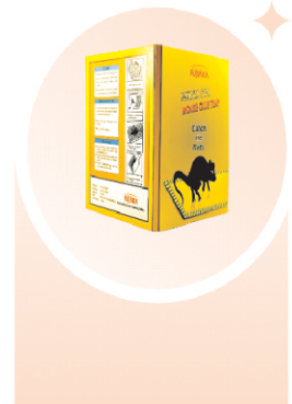
Star Glue Trap (Reg)