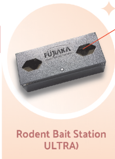
Rodent Bait Station (ULTRA)