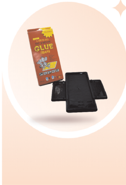
Jumbo Combro Glue Trap