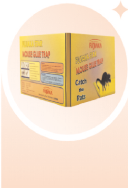
Star Glue Trap (Eco)